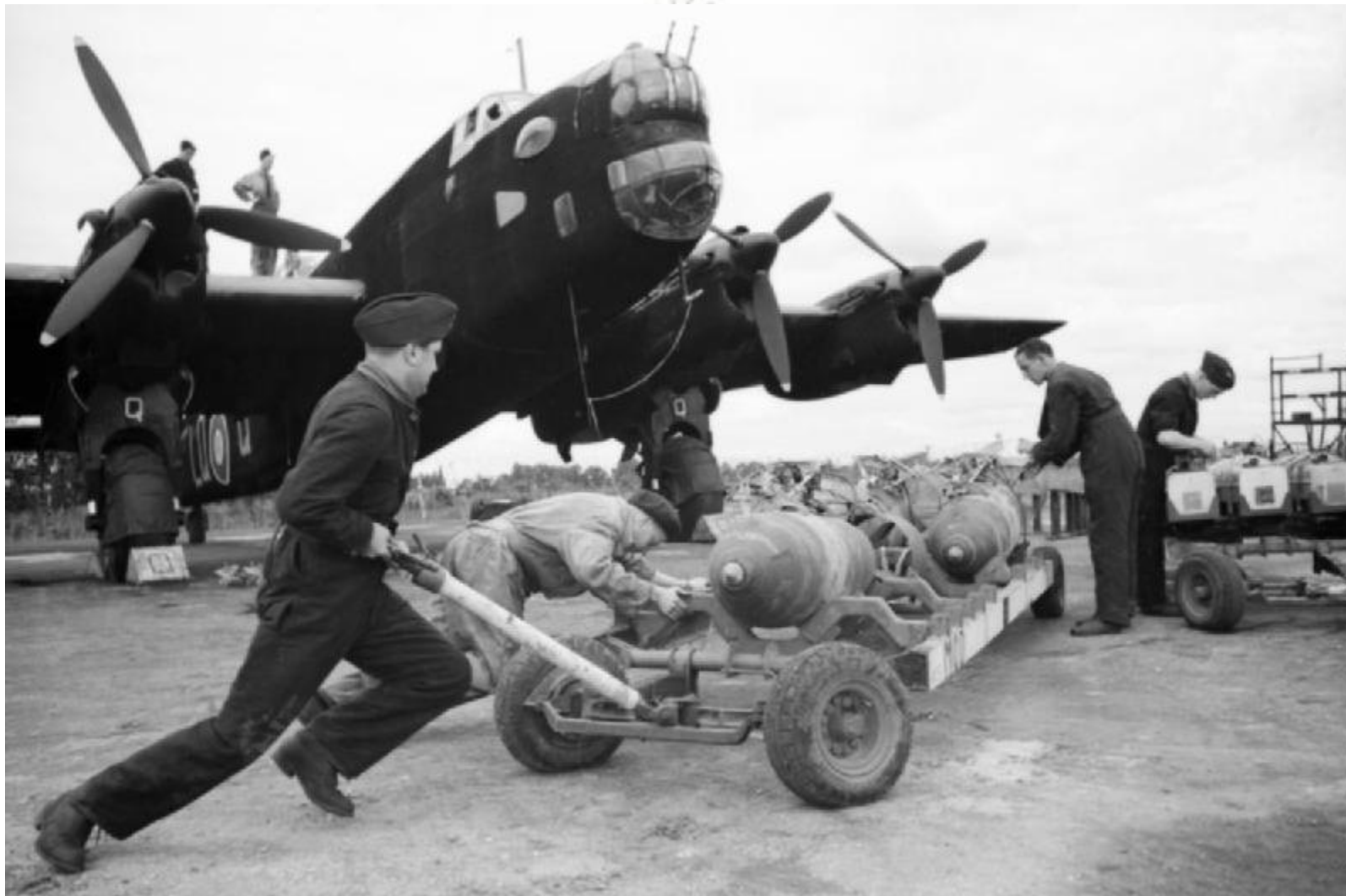
Armorer's bombing up a Handley Page Halifax Mk II of No. 405 Squadron RCAF at Pocklington in Yorkshire, August 1942.